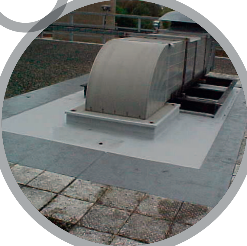
Sealing around Vents

For more information, please contact your local Belzona® representative: