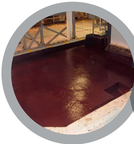
Chemical Containment Areas