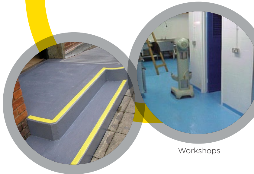
Entrance and Walkways