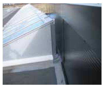
Joints & seams