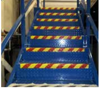
Metal stairs after