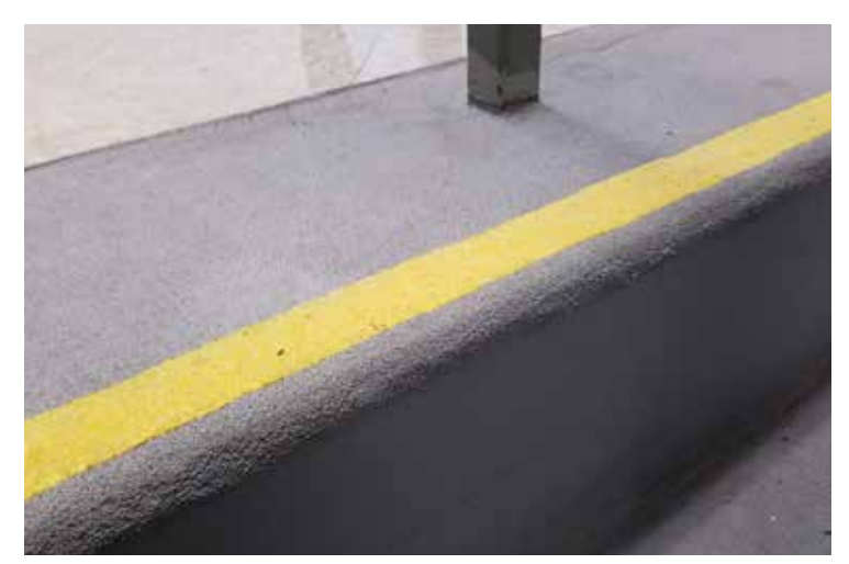
Close-up of Belzona 4411 after over one year in service

This system is easily brush-applied without the need for hot work or specialist tools.