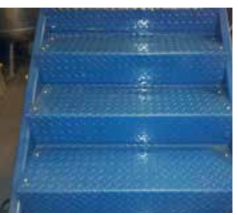
Metal stairs before