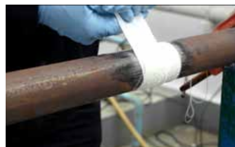
3. Apply wrap