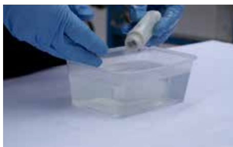
2. Soak wrap