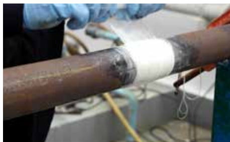
4. Apply film