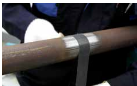
1. Roughen and clean surface