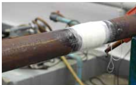
5. Application complete